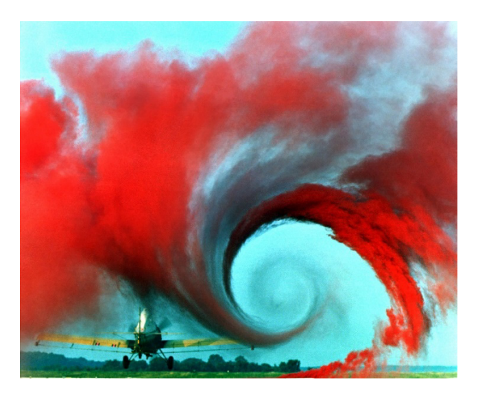
Figure 1 Turbulent flow generated by the tip vortex of the aeroplane wing shown up by red agricultural dye. (after Mae Wan-Ho, [38]).