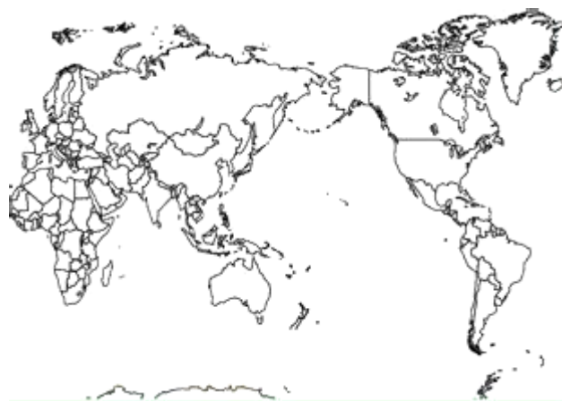
Figure 2 A black and white world map

Figure 2 is a black and white world map.