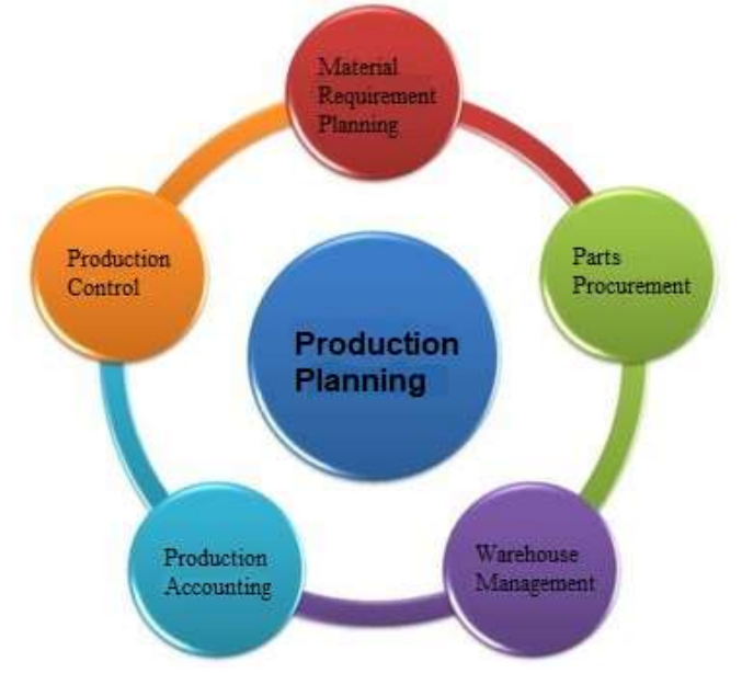
Fig. 1: Model for PP and control

The PP challenge has selected various machinery types for the manufacturing process: lathe, milling machine, grinder, jigsaw, band saw, and drill press. The main objective of the production industry is to make profit so that the company runs smoothly. It is always advisable for a company to prepare a production plan based on scientific methods to get a clear direction for how the production process should be carried out. The main objective of this study is to optimize the profit, product liability, quality, and satisfaction of workers. The input information such as, the available facilities and resource information, the units of machine available for the manufacturing items, and the number of hours spent using the machine to produce the product, including production machinery is required to formulate the problem,. The PP and control model is shown in Figure 1.