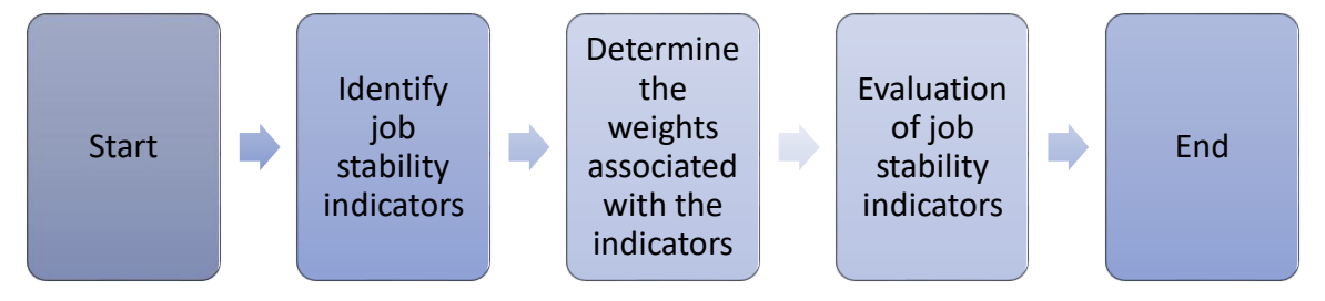
Figure 2. Structure of the proposed method.

The proposed method is designed to support the process to evaluate job stability indicators. Figure 2 shows a diagram illustrating this operation.