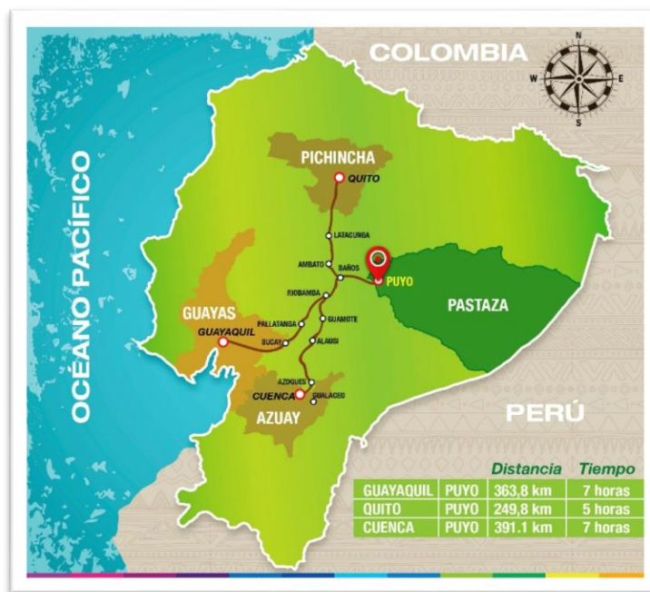
Figure 1. Pastaza Province

Based on the situation described above, this research aims to develop a method for evaluating the principle of interculturality in the custodial sentence.