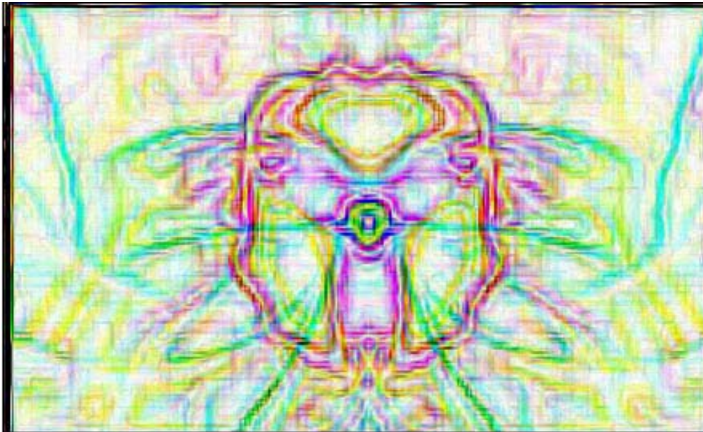
Author's Self-Portrait as Spiritual Peregrine Forever