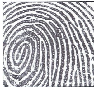
Figure 3: intra-ridge details – Sweat pores